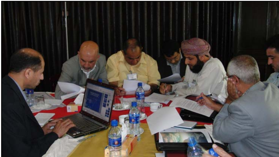
Government , Consultant and Local key People During Plan Development